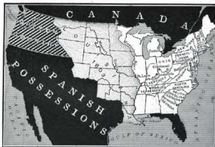
THE UNITED STATES IN 1803, AFTER THE PURCHASE OF LOUISIANA

4. What was the purpose of their exploration?